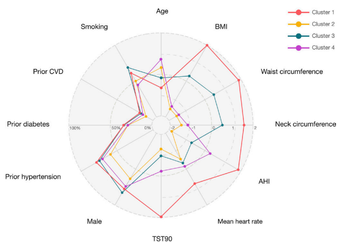
Figure 3 Radar chart comparing 12 characteristics of patients with moderate–severe OSA in each of the four clusters. Since these 12 indicators have different ranges, z-standardised scores were plotted for quantitative variables and proportions for categorical variables to simplify the interpretation of the chart. AHI, apnoea–hypopnoea index; BMI, body mass index; CVDs, cardiovascular diseases; OSA, obstructive sleep apnoea; TST90, sleep time with oxygen saturation below 90%.

AHI, apnoea–hypopnoea index; BMI, body mass index; CPAP, continuous positive airway pressure; CVDs, cardiovascular diseases; MACEs, major adverse cardiovascular events; OSA, obstructive sleep apnoea; TST90, sleep time with oxygen saturation below 90%.