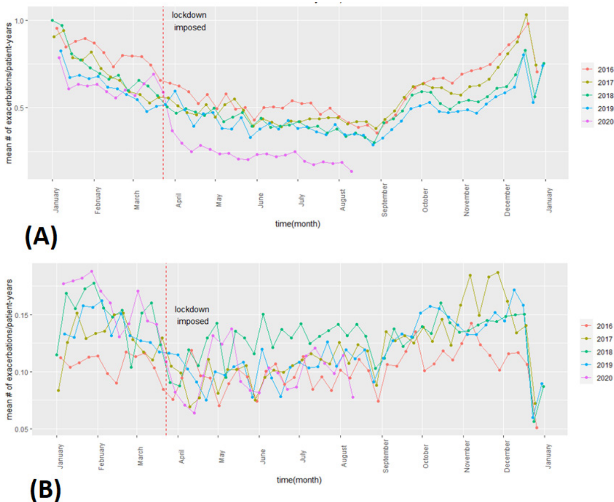
Figure 2 Mean exacerbation rate for every week, from January 2016 to August 2020 across England stratified by exacerbation type: (A) primary care-based exacerbations only and (B) hospital-based exacerbations only.

Figure 2 provides the mean exacerbation rate of the patient cohort for every week during the follow-up period (January 2016–August 2020) categorised by whether patients were