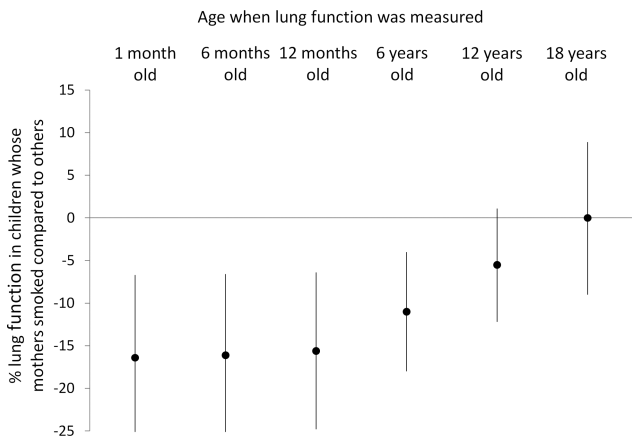
Figure 3 The mean difference in per cent of predicted lung function (circle) and 95% CIs (lines) at ages 1 month through to 18 years for those exposed to maternal smoking during pregnancy compared to other individuals. The lung function measurement at 1, 6 and 12 months was maximal flow at functional residual capacity and at other ages was FEF 25-75 . These results were from a random coefficients model which was fitted using an unstructured covariance. The p value for the interaction between lung function and time was 0.0181. The model also included maternal asthma, infant atopy, sex and flow limitation.

sample size, the reduction in V max FRC in infancy in the group with persistent wheeze might have been significant. More studies in this area are required to resolve the question 'Is asthma associated with a reduction in lung function after one month?' since the answer is relevant to the timing of an intervention aimed at preventing reduced lung function.