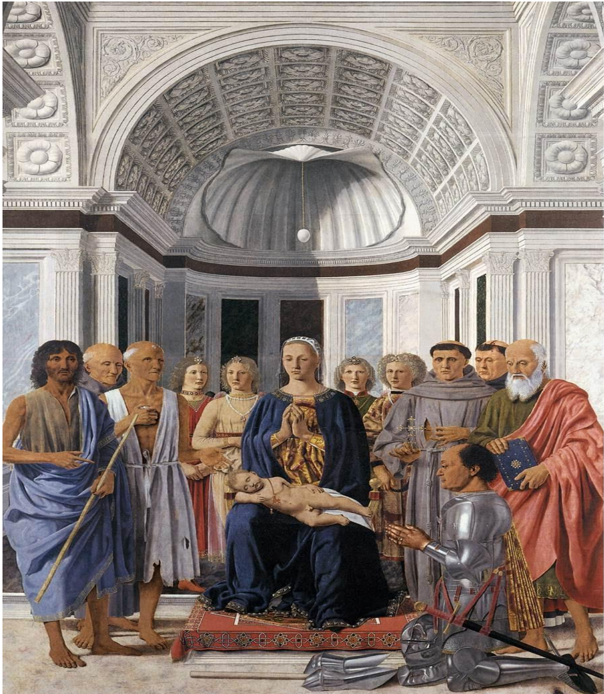
The Pala Montefeltro (1472-74). Piero della Francesca. Pinacoteca di Brera, Milan.