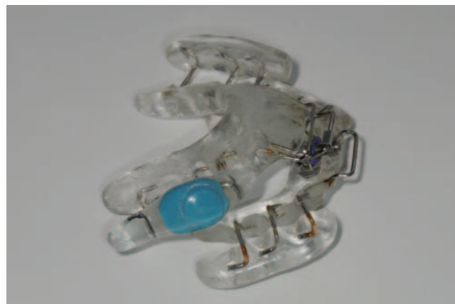
Figure 2 The microsensor is sealed into the upper right side of the custom-made titratable mandibular advancement device.

According to the ‘disease alleviation concept’, 13 objective measurement of OA compliance allows us to calculate the mean disease alleviation (MDA) (%), as a measure of therapeutic OA effectiveness. MDA is given by the product of adjusted compliance with therapeutic OA efficacy, divided by 100. The overall