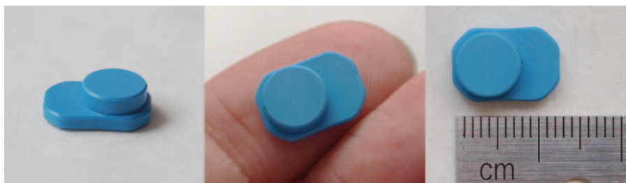
Figure 1 The microsensor thermometer with on-chip integrated readout electronics used in this study (TheraMon, IFT Handels- und Entwicklungsgesellschaft GmbH, Handelsagentur Gschladt, Hargelsberg, Austria) has a weight of 0.40 \pm 0.01 g, a length of 13.0 \pm 0.1 mm, a width of 9.0 \pm 0.1 mm and a height of 4.3 \pm 0.1 mm. The sampling interval of the temperature recording was programmed at one measurement per 15 min with a memory capacity of approximately 100 consecutive days.

currently the most common class of OAs used to treat SDB. 16–19 The efficacy of OA therapy has been demonstrated in randomised controlled clinical trials, and there is emerging evidence on its beneficial cardiovascular effects. 15 20 21 OA therapy is indicated in subjects who do not tolerate or comply with CPAP, and it may be a first-line treatment in snorers and patients with mild to moderate OSA. 15 OA therapy can also be considered as a temporary alternative for CPAP, or a rescue treatment after upper airway surgery failure. 7 15 22