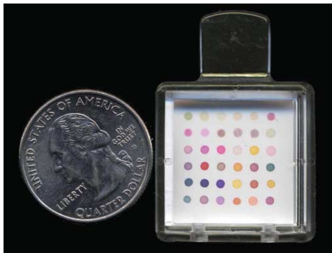
Figure 1 The colorimetric sensor array used in this study consists of 36 chemically sensitive dots impregnated on a disposable cartridge.

We enrolled subjects with non-small cell lung cancer regardless of stage of the disease. In addition, controls with disease and