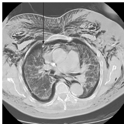
CT chest performed 2 days post bronchoscopy shows bilateral extrapleural air collection with right internal mammary artery traversing the collection (arrow), multiple fibrous septae within the collection and extensive surgical emphysema. See Image page 276.

Surgical resection is the treatment of choice for early non-small cell lung cancer (NSCLC) and these patients have the best prognosis. However, local recurrence is a common cause of death in this group and the course and predictors of post-recurrence survival in resected stage I NSCLC have not been studied. In this month's Thorax , Hung and colleagues studied local recurrence and its outlook in stage I NSCLC. The hazard of death was greater with large tumour size. Patients who were operated on again had the best outcome. These results are discussed in an accompanying editorial by Pham and Harpole, who remind us that our success rate with the management of stage I NSCLC can be improved. See pages 185 and 192