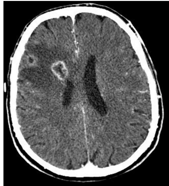
Figure 2 CT scan of the brain showing ring-enhancing lesions in the right frontoparietal lobe with surrounding oedema and mass effect.

(BAL). The airways were inflamed with inspissated yellow secretions visible on the left. Histological examination of the cerebral biopsy specimen was consistent with a cerebral abscess, but no granulomatous inflammation was identified. All cultures from the BAL fluid and cerebral abscess were negative.