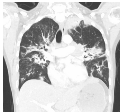
Figure 1 Coronal CT scan of the chest showing ground glass and dense airspace opacification in a bronchocentric distribution throughout both lungs. There is also left hilar enlargement and multiple pleural masses.

Department of Pathology and Laboratory Medicine, Vancouver General Hospital, Vancouver, Canada