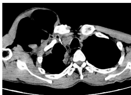
Figure 3 CT scan of chest showing extrathoracic air filled compartment in communication with the right lung (arrow) at the level of the body of the T4 vertebra.