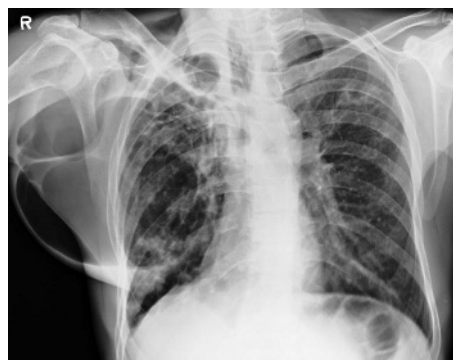
Figure 2 Chest radiograph showing bilateral airspace consolidation with multiloculated radiolucent area in the right lung field and an extrathoracic extension containing a fluid level.