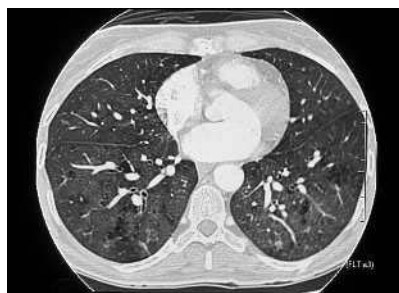
Figure 1 CT scan of thorax of a patient showing diffuse ground glass opacities.

transfer factor (TLco). All patients had diffuse bilateral ground glass opacities on a high resolution CT scan, most often sparing the subpleural areas (fig 1). Every patient improved following treatment with oral prednisone (0.5–0.9 mg/kg) but residual dyspnoea and reduced TLco (<80% of predicted value) could be seen for more than 2 weeks.