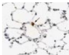
See p 765

NEW ONLINE SUBMISSION GO TO WEBSITE TO SUBMIT YOUR MANUSCRIPT