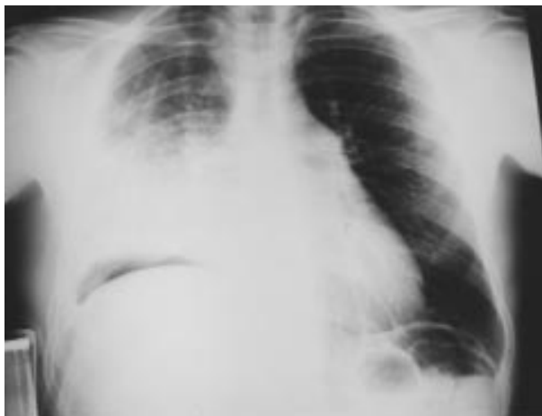
Figure 1 Chest radiograph obtained on the first postoperative day showing an infiltrate in the lower half of the right upper lobe.

A 29 year old white man underwent right middle and lower lobectomy to resect a well differentiated neuroendocrine carcinoma (atypical carcinoid tumour). An invasion of the right inferior pulmonary vein was detected and partial resection of the left atrium was necessary. The patient had an