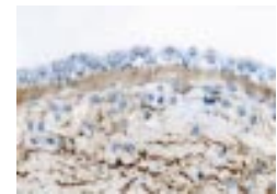
See p 164