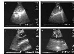
See p 1083