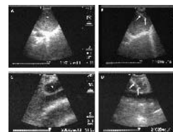
See p 1083