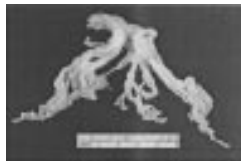
See p 81