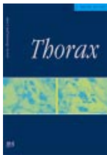
See p 678