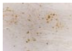
See p 627