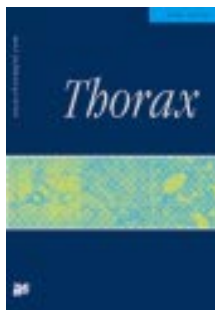
See p 637