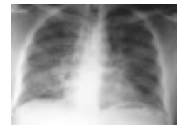
See p 656