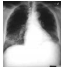
See p 465