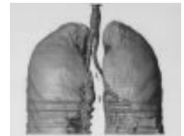
See p 372