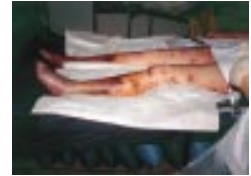
See p 170