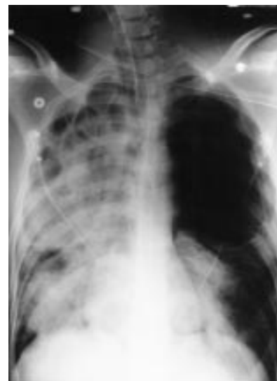
Figure 3 Chest radiograph taken during mechanical ventilation showing a left sided chest tube and infiltrative changes in the scarce residual pulmonary tissue.

A 40 year old man was admitted with progressive dyspnoea, cough, and fever. According to his relatives he had been smoking cocaine (so called "free basing") for the past 17 years. A reliable history of tobacco smoking could not be obtained because of his respiratory distress and poor level of consciousness. His medical history consisted of recurrent respiratory tract infections. Chest