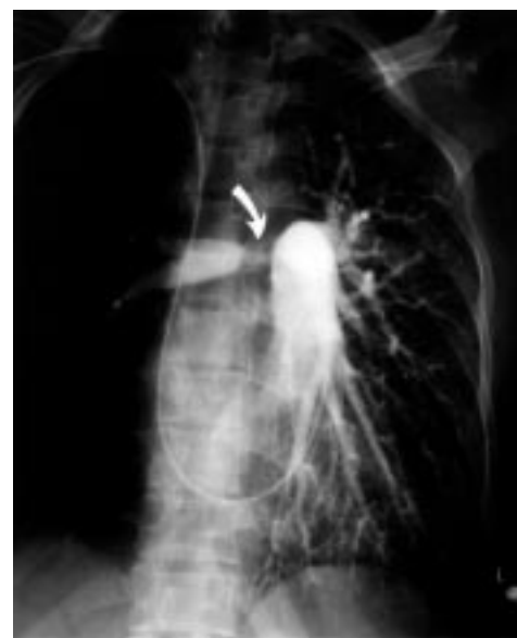
Figure 2 Pulmonary angiogram in case 1 (anterior view) showing stenosis of the right main pulmonary artery.

Department of Respiratory Medicine W M Drake S L Elkin D M Mitchell R J Shaw