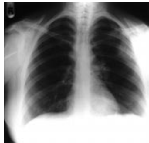
Figure 1 Chest radiograph showing pleural mass at presentation.

Symptoms settled with conservative treatment and the patient remained asymptomatic for 12 months. She then developed increasing breathlessness with an associated change in pulmonary function ( FEV_1 2.85 l, VC 3.55 l, TLCO 4.04 mmol/min/kPa, KCO 1.03 mmol/min/kPa/l). Diffuse nodular shadowing developed throughout both lung fields on the chest radiograph. Prednisolone was started at a dose of 30 mg/day, leading to improvement in pulmonary function ( FEV_1 3.25 l, VC 3.95 l, TLCO 5.20 mmol/min/kPa and KCO 1.30 mmol/min/kPa/l) and partial regression of the nodular shadowing after several weeks of treatment. There was a steady decline in the size of the pleural mass over the following nine months with continued clinical improvement.