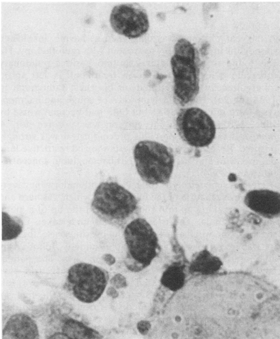
Fig 2 Case 2: Sputum showing single lymphoma cells. ( \times 485 .)

The morphological features of the lymphoid cells seen on