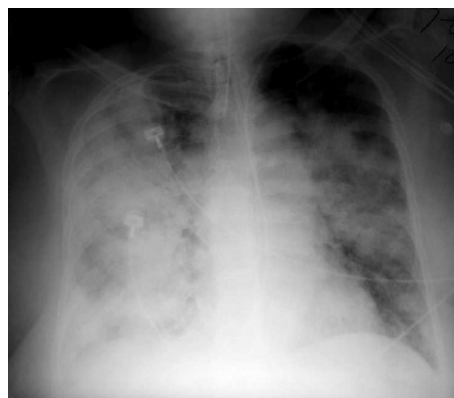
Figure 1 Chest radiograph showing bilateral multifocal areas of nodular consolidation.

Multiple myeloma may involve the thorax in a variety of ways, but pulmonary parenchymal involvement is uncommon. Thoracic manifestations include skeletal abnormalities,