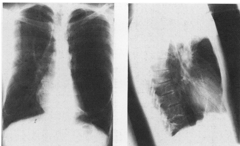
Figure 1 Chest radiograph showing a large cystic lesion occupying almost the entire left hemithorax displacing the trachea and mediastinum to the right.