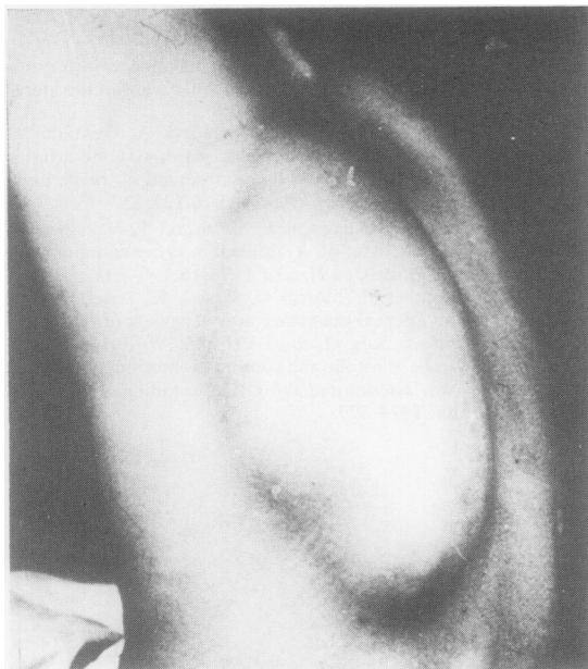
Fig 1 Clinical photograph showing the swelling lying to the left of the spine.

Address for reprint requests: Dr Banerjee, 249 Sheikh Sarai, New Delhi-110017, India.