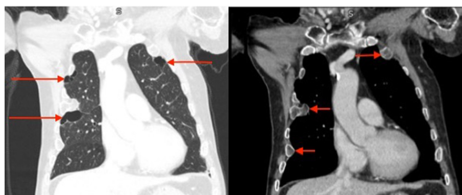
Figure 1 Coronal imaging showing cystic change on lung windows (A) and exostoses on soft tissue windows (B).

© Article author(s) (or their employer(s) unless otherwise stated in the text of the article) 2018. All rights reserved. No commercial use is permitted unless otherwise expressly granted.