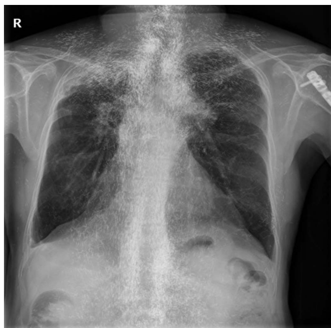
Figure 1 Chest X-ray showed numerous thin linear metallic radio-opaque densities scattered on whole body especially in neck, upper chest and axial part.

Acupuncture is a traditional Eastern medicine that uses needles to purportedly stimulate certain points on the body to alleviate pain. 1 Recently, even in Western countries, the prevalence of therapeutic strategies involving acupuncture is increasing, 2 and their widening acceptance demands continual updating of safety regulations. 3 In this case, acupuncture with golden needles penetrating to the internal organs caused radiographic artefacts on chest radiographs. Although there were no complications in this case, it demonstrates the need for awareness of the possibility of improper use of acupuncture.