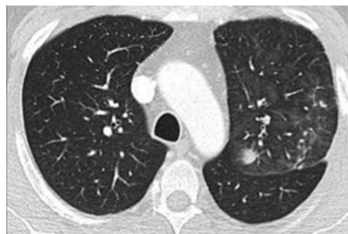
Figure 1 High-resolution CT images of the thorax demonstrating multifocal ground-glass opacities confined to the left upper lobe.

It is noteworthy, however, that PVS may develop and progress over several months following ablation, thus giving rise to a lag between the time of procedure and the onset of symptoms. This temporal dissociation often makes diagnosis challenging and thus a high diagnostic index of the suspicion is required when new cardiorespiratory symptoms develop weeks to months after an