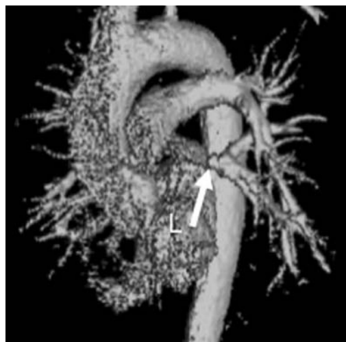
Figure 3 Surface-rendered image reconstructed in the right anterior oblique view from contrast-enhanced magnetic resonance angiography acquisition showing significant focal stenosis of the left common pulmonary vein (arrow). L, left atrium.

TMM: There is a lack of consensus on therapeutic strategies for postablation PVS. There is general agreement that patients with symptomatic severe PVS should be treated with pulmonary vein angioplasty with or without stenting. 5 In this case, following diagnosis, the patient underwent balloon dilatation of the left common pulmonary vein (see ref. 9 for description of the procedure). It is recognised that the pulmonary veins are susceptible to in-segment restenosis; 5–9 however, patients often remain asymptomatic if this occurs. A year on from balloon dilatation, our patient remains well, without further exercise-induced