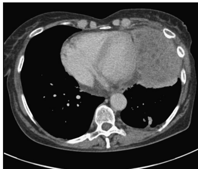
Figure 2 CT scan of chest, March 2010: large mass within the left pleural space, which appears to invade the anterior chest wall.

a mass lesion in the left hemithorax, which was confirmed by a CT scan (figures 1 and 2).