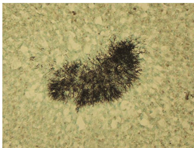
Figure 5 Actinomycosis colonies under Grocott's methenamine silver stain.