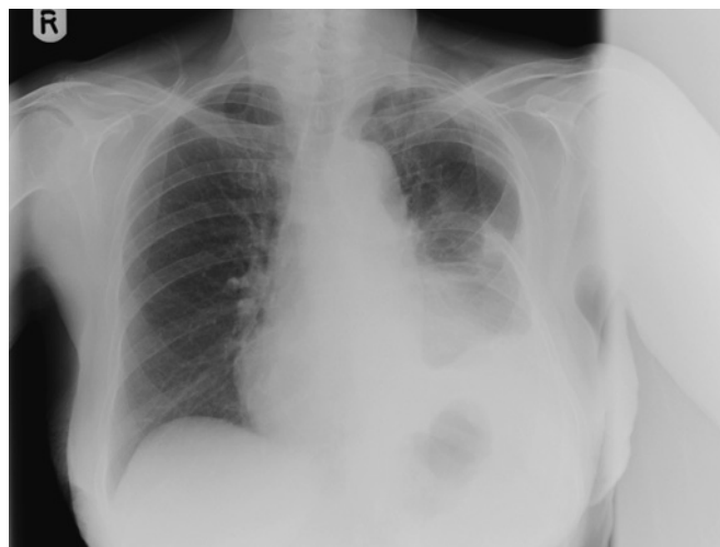
Figure 6 Follow-up chest x-ray, September 2010: loss of volume of the left lung and partial rib resection due to the previous thoracotomy. There is blunting of the left costophrenic angle, elevation of the left hemidiaphragm and increased density at the left base due to the previous thoracotomy. The right lung is clear.