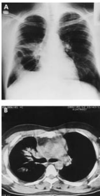
Figure 2 (A) Posteroanterior chest radiograph and (B) CT scan showing marked reduction in the lesions shown in fig 1.

We conclude that, in patients with a large or bilateral pulmonary BALT lymphoma, transbronchial or transthoracic biopsy and mediastinoscopy are useful diagnostic procedures