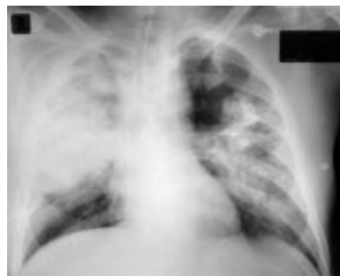
Figure 2 Chest radiograph of a 61 year old aboriginal man with diabetes mellitus and previous splenectomy for trauma who presented with cryptococcal pneumonia ( C neoformans var gattii ) showing extensive bilateral air space consolidation. A few faint air bronchograms were visible in the right upper lobe on the original film.

Masses occurred more often in the right lung (n = 13) than the left (n = 5), and in the lower lobes (n = 13) more often than the upper and middle (n = 5). Neither of these differences was statistically significant (two tailed binomial distribution, p = 0.096). Air space consolidation showed no lobar predilection, and interstitial