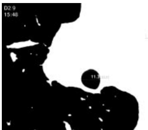
Figure 3 The same slice of intermediate bronchus (arrowed) as in fig 1 at a window level of -600 HU and a window width of 2 HU. The wall/lumen interface is crisply delineated but this method has not been validated by phantoms.

nying artery. 36, 37 Most studies then subdivide it, according to the Reid criteria, 38 into three types: cylindrical, varicose, or cystic. Lynch and colleagues 31 have suggested that this definition may overestimate the prevalence of bronchiectasis. In their asthmatic group 36% of the bronchi fulfilled the criteria for bronchiectasis but so did 26% of the control bronchi, although there was a difference in the techniques used as fewer slices were taken from the control group. Others have found no features of bronchiectasis in healthy controls. 18