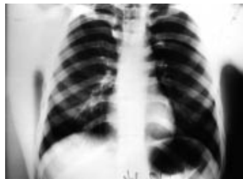
Figure 1 Posteroanterior chest radiograph showing unilateral translucency of the left lung.

A posteroanterior chest radiograph (fig 1) revealed unilateral translucency of the left lung, and air trapping was found on inspiration-expiration chest radiographs. Lung function