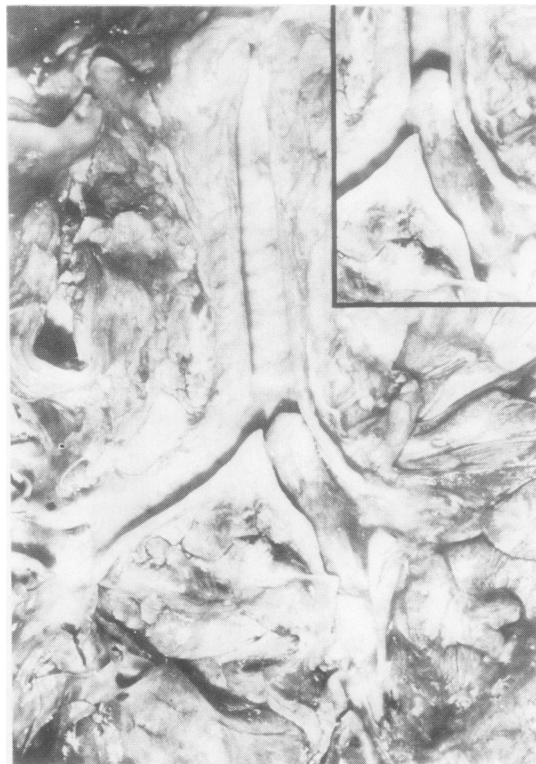
Fig 1 Posterior view of the bronchial tree at necropsy. The sessile polypoid tumour virtually fills the right main bronchus and, because of its elastic pedicle, can easily be dislocated to override the carina (inset).

Address for reprint requests: Dr A Eriksson, Institute of Forensic Medicine, University of Umeå, Box 6016, S-900 06 Umeå, Sweden.