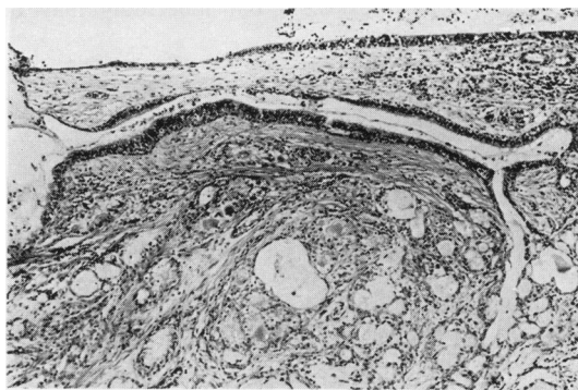
Fig 2 A ductlike structure opens into the bronchial lumen at top left, runs parallel to the surface of the tumour and terminates in acini at bottom right. Haematoxylin and eosin, original magnification \times 70 .

nuclei had an open chromatin pattern and a single prominent nucleolus. No mitotic figures were observed. Occasional densely basophilic pyramidal nuclei, which closely resembled those of myoepithelial cells, were situated at the periphery of the acini.