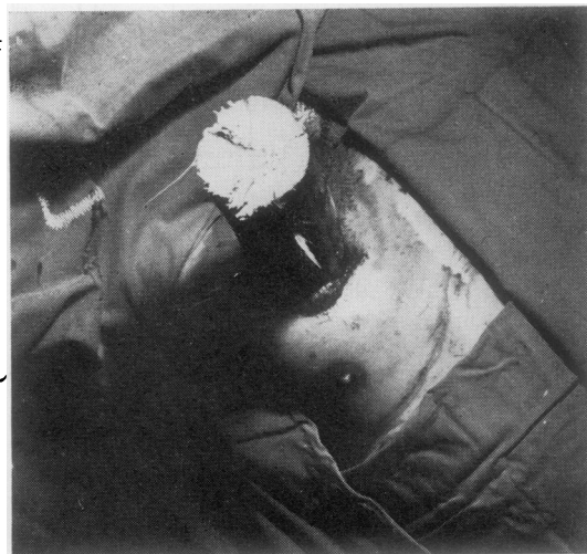
Fig 2 Preoperative view of the impaled chest.

Address for reprint requests: Professor A Grossi, Università Degli Studi di Siena, Istituto di Chirurgia Toracica e Cardiovascolare, 53100 Siena, Italy.