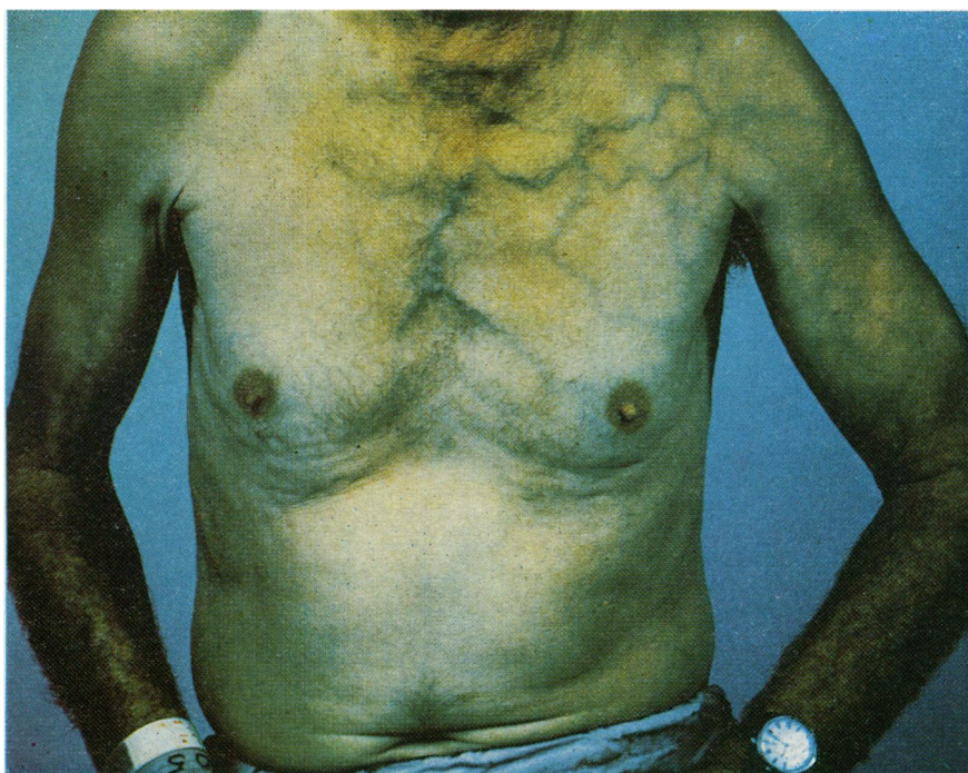
Fig 1 Infra-red photograph demonstrating venous engorgement over the left upper thorax and arm.