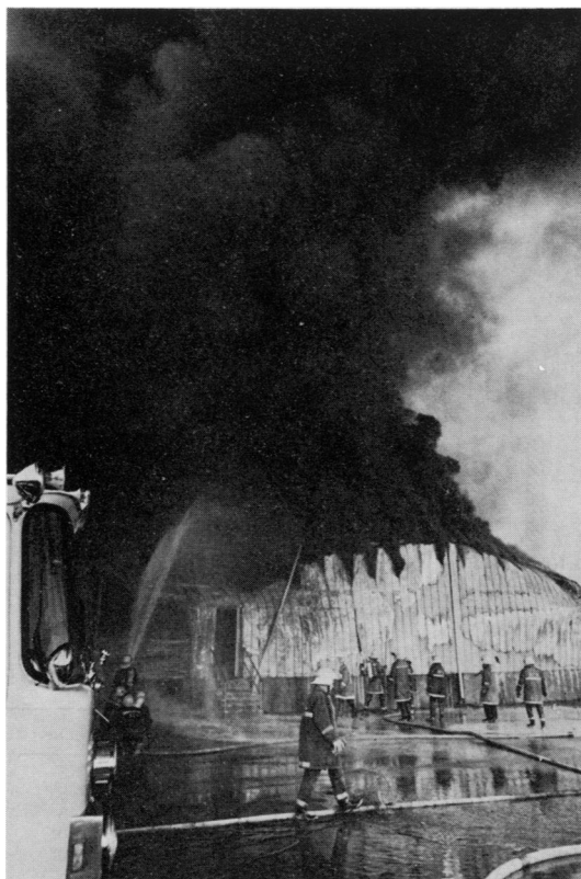
Fig 1 Firemen extinguishing this fire, illustrating the close proximity of the men to the smoke. Published by kind permission of the Houston Post Company.

height using the regression equations of Morris et al 6 for white subjects and of Stinson et al 7 for black subjects.