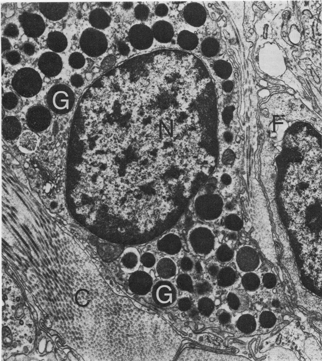
Fig. 3 A perivascular mast cell as seen under the electron microscope. It contains a large central nucleus (N) and numerous electron-dense secretory granules (G) which in favourable sections can be seen to be bounded by a single limiting membrane. It is these granules which are believed to contain vasoactive substances. The mast cell is surrounded by collagen fibrils (C) and fibrocytes (F) of the adventitia of the vessel. Electron micrograph \times 18\ 750 .

H 1 receptors were stimulated alone (by selectively blocking the H 2 receptors) there was an abrupt pulmonary pressor response which was sustained