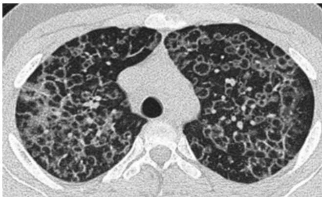
Figure 1 Chest CT at presentation showed innumerable ring opacities, some of which surround a centre of ground-glass opacification, throughout the lung.

Crescentic or ring-shaped opacities surrounding an area of ground-glass opacification occasionally seen in the setting of organising pneumonia were first described by Voloudaki 1 and later coined the 'Atoll sign' by Zompatori. 2 Kim et al. documented it in 19% of cases of cryptogenic organising pneumonia. 3 The word Atoll is derived from the Maldivian word 'atholhu' meaning an island consisting of a circular coral reef surrounding a lagoon (figure 2B). Although originally thought to be specific for organising pneumonia, this CT appearance has been described in a variety of other diseases including sarcoidosis, 4 Wegener granulomatosis, 5 lymphomatoid granulomatosis, 6 pulmonary paracoccidiomycosis 7 and non-specific interstitial pneumonia, 8 and under different names including the 'reversed-halo' sign and the 'fairy-ring' sign. Histopathologically the ground-glass opacification centrally represents septal inflammation, and cellular debris within the airspaces and the peripheral crescentic or ring-shaped opacity represents organising pneumonia in the alveolar ducts. 1 From a learning perspective, although this striking CT appearance is well documented in organising pneumonia, it should alert the radiologist and physician to other possible diagnoses, of which Wegener granulomatosis is particularly important.