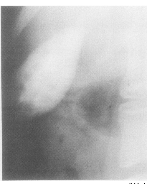
Fig 1 Cholecystogram showing a functioning gall bladder containing small radiolucent stones (case 1).

Cystic fibrosis was diagnosis in this patient at the age of 9-months. He remained relatively well until the age of 22 years, when he developed a respiratory infection due to Pseudomonas aeruginosa, which was treated with intravenous antibiotics. He was taking 20 Pancrex tablets before meals ato that time to control steatorrhoea. Subsequently he reported episodes of severe right upper quadrant abdominal pain radiating to his back. An abdominal Ultrasound examina-∋ tion showed multiple gall stones. Oral cholecystography showed that the stones were radiolucent and that the gallo bladder functioned normally. As his FEV, was only 0.6 lo (15% predicted) and VC 1 81 (38% predicted) ursodeoxycholic acid 150 mg thrice daily was started. His weight was 52.3 kg and his height 1.70 m. The attacks of pain diminished in duration and frequency over the next few months and one